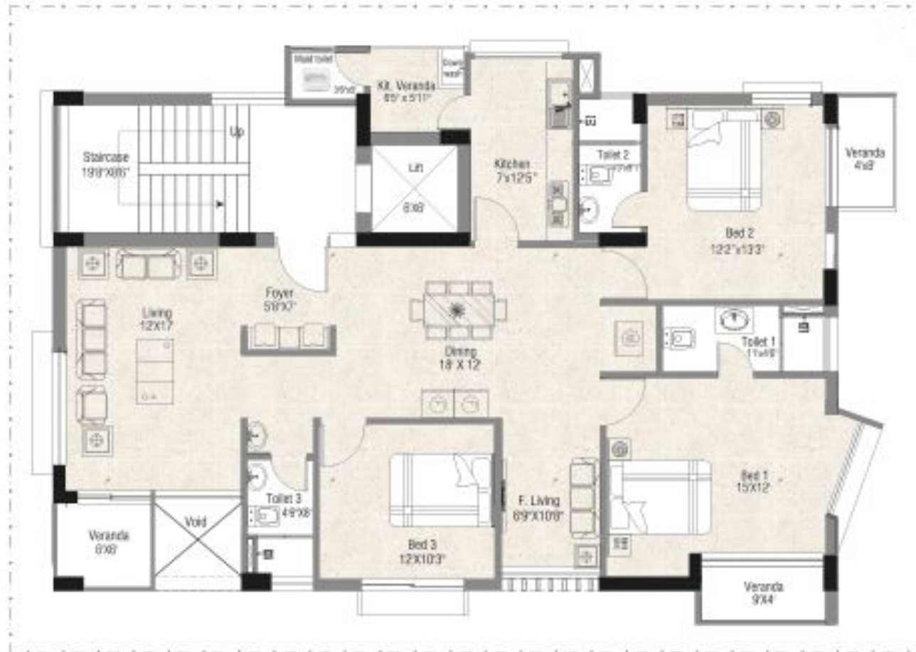
1ST TO 7TH FLOOR PLAN